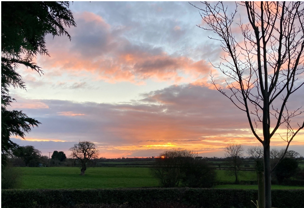
Sunset over Huxley - Anne Smart