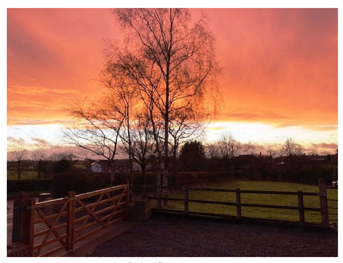
Huxley "Sahara" Sunset - Anne Smart