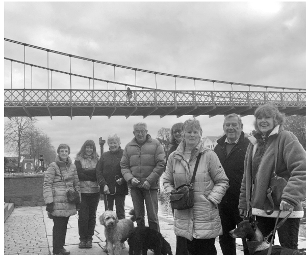
Walking Round The City Walls